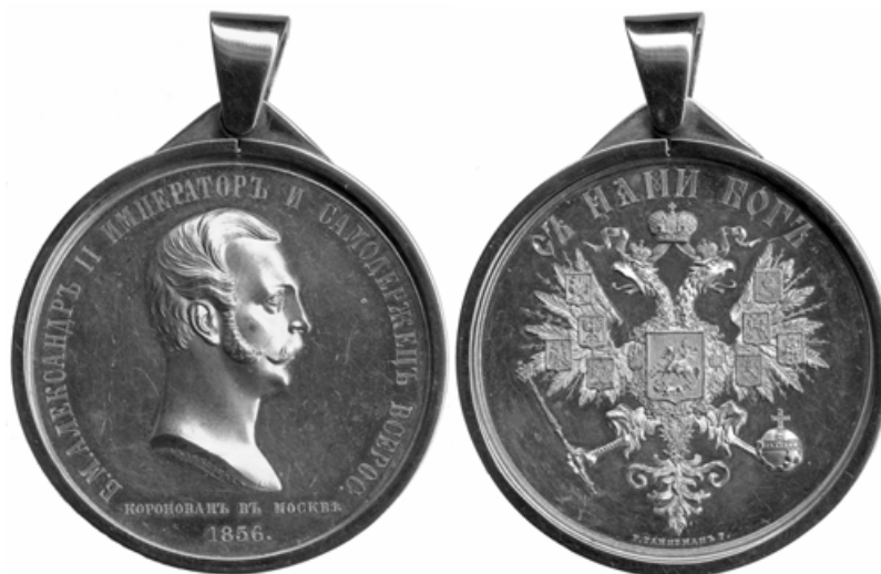
250 Imperial Russia , Coronation of Alexander II, Moscow 1856, gold medal of 30 ducats weight, by Lialin and Kutchkin, bare-headed bust right, rev. , Imperial eagle (Smirnov 603), loosely fitted into a modern ring mount, a few surface marks, otherwise extremely fine and rare [total wt. 119.30 g all in] £3,500-4,500

Ex Sotheby's Russian sale, 15/16 December 1995, lot 90.